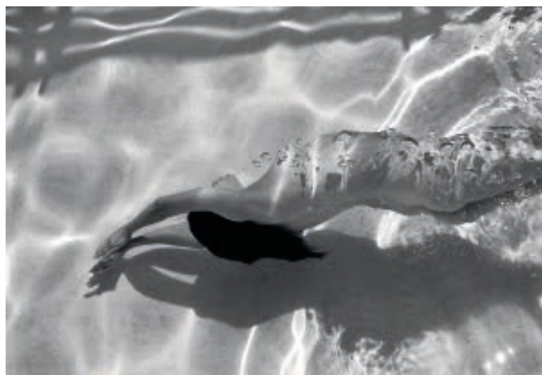
Bathing pool beauties: Deanna Templeton discovered the fascinating interplay of human body, water and light, just by chance (page 52)