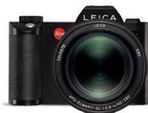
A tele-zoom for the Leica SL: the Apo-Vario-Elmarit-SL

Spotting scope adaptor for the Leica Q and an M lens to build yourself