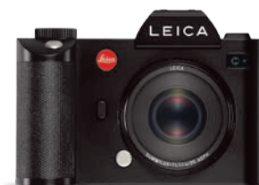
You do not always have to use same-system lenses: SL with Summilux-TL

A new appearance for the S Magazine website