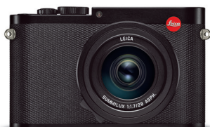
Full frame sensor and 28 mm fixed focal length: the new Leica Q