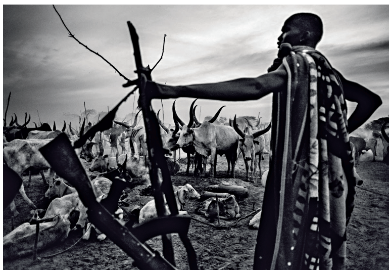
Fabio Bucciarelli's images of civil war in South Sudan qualified him as a finalist for the 2015 Leica Oskar Barnack Award (as of page 12)