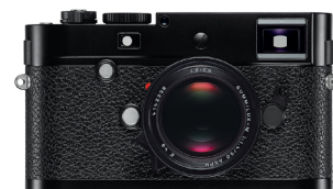
The new Leica M-P is also made unique by the rangefinder

Store, process, manage: Leica's new online platform