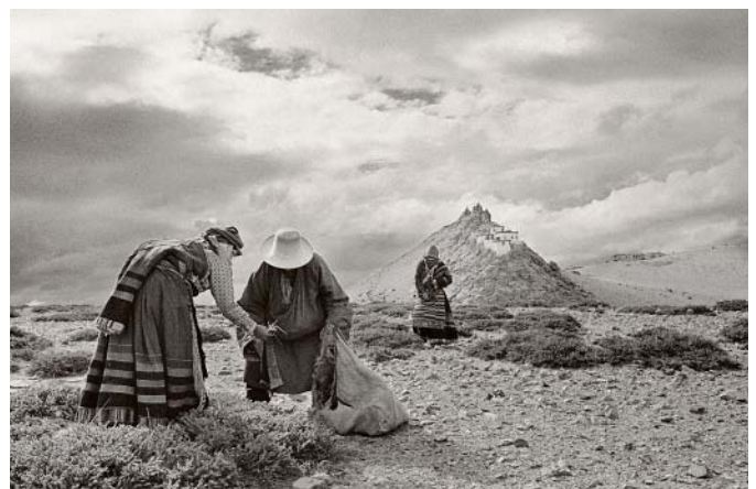
Peter Bialobrzkeski, Summarit-S 35 mm f/2.5 Asph (page 8) The Noctilux-M 50 mm f/0.95 Asph (page 24) Pierre Crié: Tibetan pilgrimage (page 48)