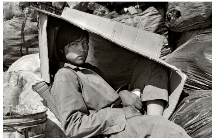
Horst A. Friedrichs: Birmingham, 2004 (page 8) New Leica X1 in action (page 34) Franck Courtel: Nezahualcōyotl, Mexico (page 68)