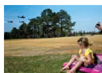
Helicopter formation on 'All American Day', Fort Bragg, North Carolina, 2006