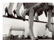
Cover photo: Herbert Dombrowski, Elsner shoes, 1957