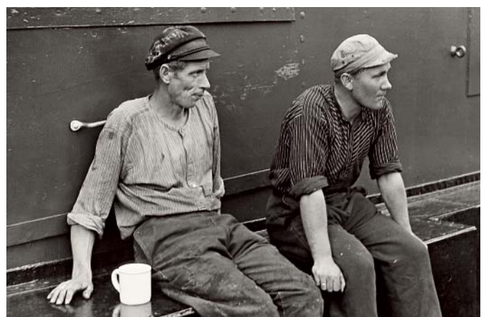
Pascal Meunier: Hammam in Damaskus (page 54) Macro photography with Digital Module R (page 24) Herbert Dombrowski: Coffee break, 1958 (page 10)