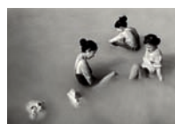
Cover photo: Keenpress, Bathing Italians in the blue lagoon, Iceland, 2003