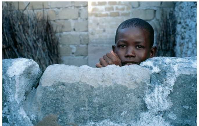
Keenpress: from the series 'The Space Between' (page 6) Accessories: something for every taste (page 22) Werner Mansholt: Zanzibar, 2008 (page 52)