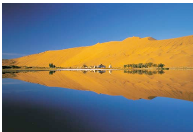
Jürgen Holzenleuchter: Shoe production, Italy (page 54)