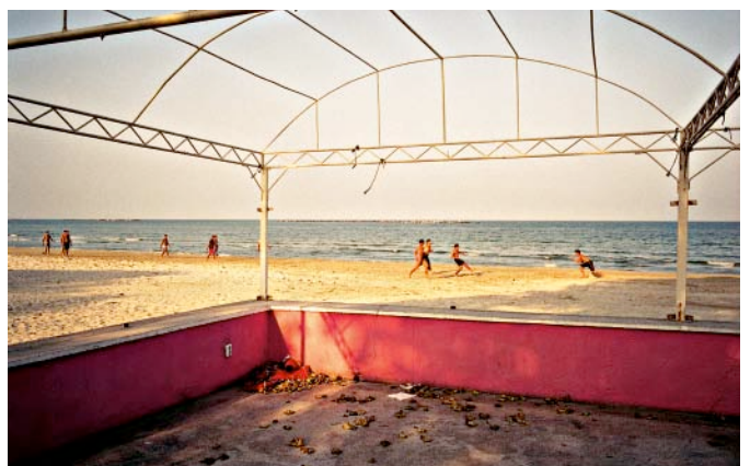
Fritz Block: New York, 1931 (page 14)