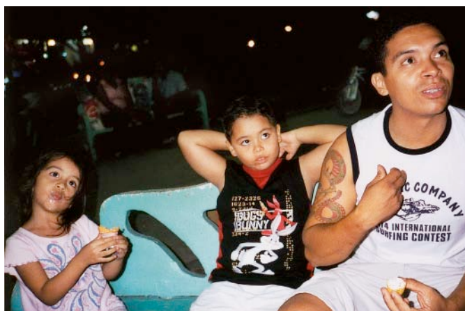
Fritz Block: Hamburg Elbe bridge, 1929 (page 6)