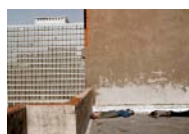
Cover photo: Guy Tillim, Johannesburg, 2004