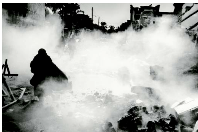
Werner Mansholt: Encounters in India (page 18) Epson R-D1: Digital platform for M lenses (page 38) Jan Grarup: Bam ruined by an earthquake (page 56)