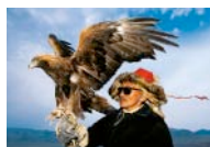
Kasakh in the Altai Mountains