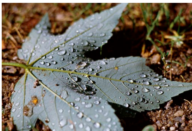
Horst Faas: Vietnam, 1964 (page 56)