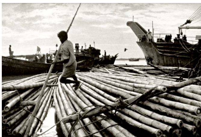
Emin Kadi: in South Africa (page 10)